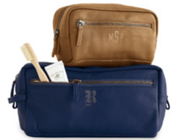
EVERYDAY LEATHER TRAVEL POUCH The classic kit for the consummate traveler. SM 50-441139 4.5”h x 8”w x 3.5”d $79 ; LRG 50-1283367 5.5”h x 10.5”w x 4”d $110