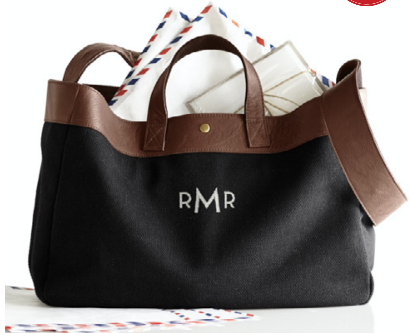
THE CANVAS POST TOTE For men or women, work or school, travel across continents or across town - the cotton canvas tote features leather trim, a coordinating cotton lining, an open inner pocket, both long and short straps and, of course, your choice of handsome embroidered monogram. 10.3”h x 16.5”w x 4.75”d 50-2422673 $175