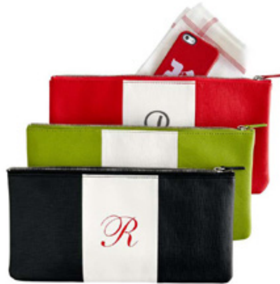
COLORFIELD CLUTCH Linen-lined clutch is wide enough to tuck under the arm for day trips or nights on the town. 6”h x 12”w x .25”d 50-1709971 $45