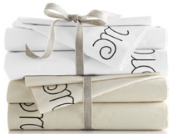
M+G ESSENTIAL SHEET SET 400-thread count percale cotton. Set includes a fitted sheet, flat sheet and two pillow cases. Twin-CA King 50-463810 $139-$189