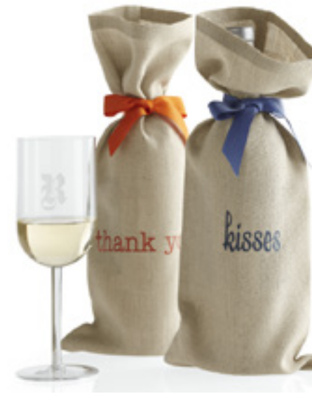
LINEN WINE BAG For a housewarming, hostess or holiday, this wine bag is a warm and welcoming way to gift a tasty bottle. 14.5"h x 6"w 50-430926 $15 EACH