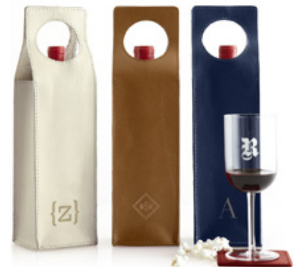
EVERYDAY LEATHER WINE TOTE A sleek reusable tote in a choice of colors to coordinate with your red, white or rosé. 15”h x 4”w x 3.5”d 50-440701 $36