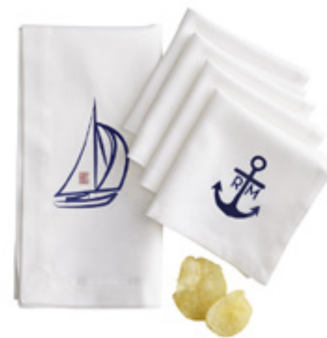
THICK WHITE NAPKINS Durable white cotton makes a perfect backdrop for a pop of personalized color. COCKTAIL 10” x 10” $19 | DINNER 20” x 20” 50-426510 $35