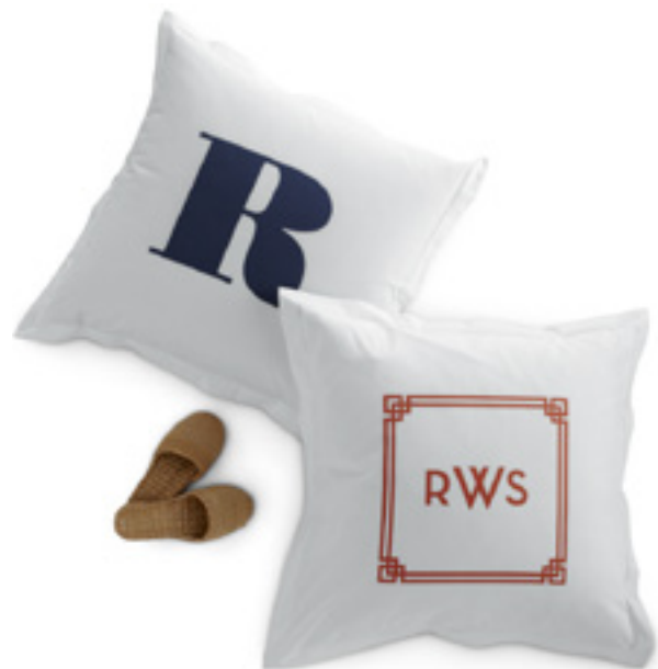
MAKE YOUR MARK EURO SHAMS Make a Euro-sized statement with clean white cotton and a brightly colored monogram. 50-877845 $40