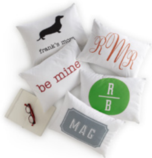
MAKE YOUR MARK BOUDOIR SHAMS A small, yet bold, statement of sleep. Choose from a variety of typefaces to make your mark. 50-877845 $30