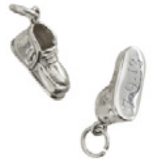
Personalized Baby Shoe