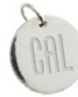
Round Personalized Disc