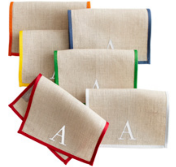
TYPOGRAPHER'S LINEN COCKTAIL NAPKINS, MULTI SET OF 6 A bold monogram + a pop of color on 100% linen. Set includes 6 colors. 9.5"w x 6.5"h 50-426577 $44