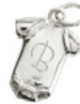
Monogram Baby Onesie