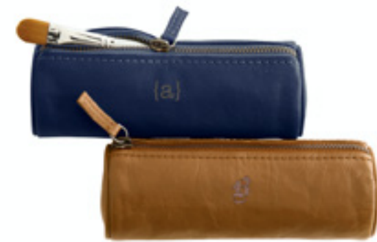
EVERYDAY LEATHER MINI ROLL For pens, keys, cosmetics, jewelry or other small, important items. Linen lining. Laser engraved. 7.5”w x 2.75”d 50-446486 $39