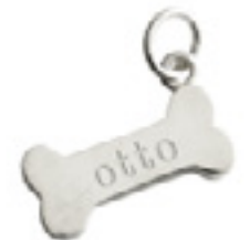
Personalized Dog Bone

CHARMS 50-6329080 1. PERSONALIZED HEART $75 | 2. ROUND PERSONALIZED DISC $75 | 3. PERSONALIZED PADLOCK $99 | 4. MONOGRAM BABY ONESIE $75 | 5. SUITCASE LOCKET $75 | 6. PERSONALIZED BABY SHOE $75 | 7. YEAR OF THE HORSE $55 | 8. WISHBONE AND SHAMROCK $55 | 9. PERSONALIZED DOG BONE $75