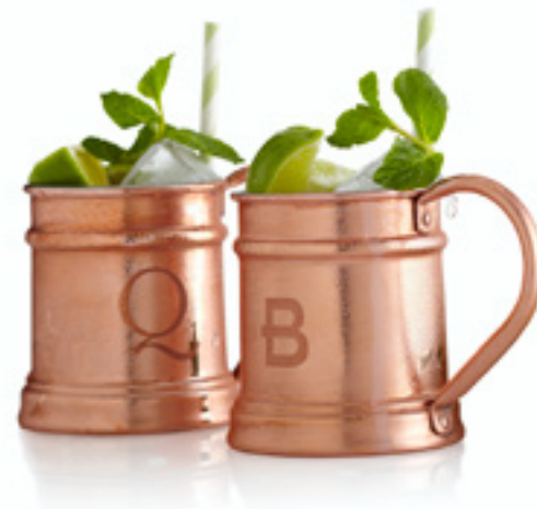
COPPER MUG This classic beauty will happily house a refreshing beverage. 16.5 oz. 50-382366 Available with or without monogram. $25-$30