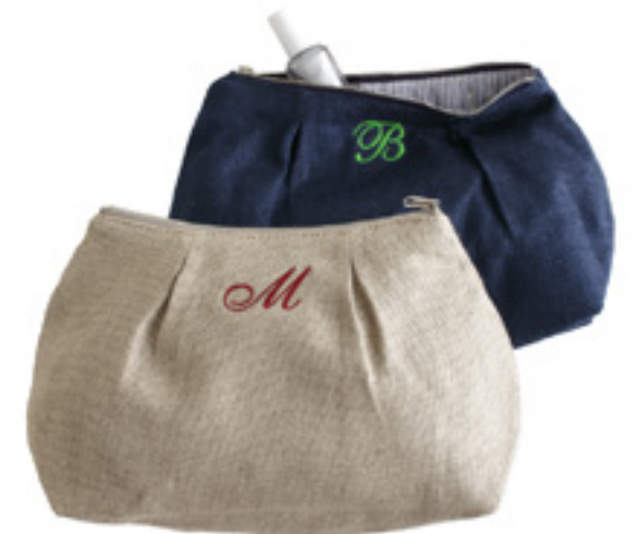
VOYAGE PLEATED COSMETIC BAG Organize your purse, suitcase or health and beauty aids. 100% linen lined in cotton. 7.5”h x 11”w 50-1600172 $35