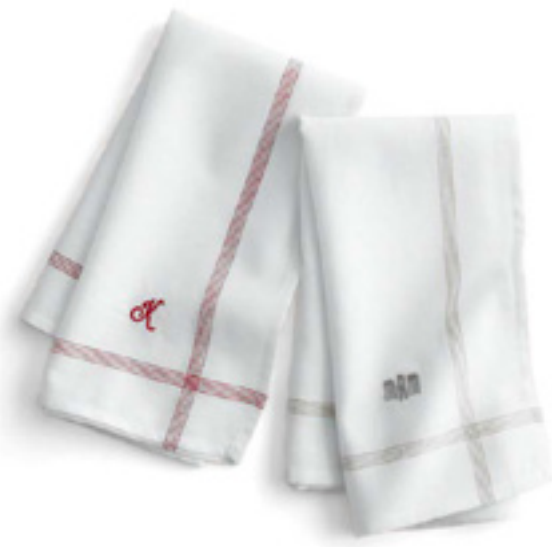
WINDOWPANE HANDKERCHIEFS, SET OF 4 For emotional moments or dabbing eye make-up, 100% cotton and eco-friendly. 16”h x 16”w 50-1881467 $35