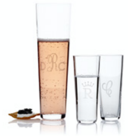
HAND-BLOWN STEMLESS FLUTE, SHOT GLASS Make your mark and cheers for years. FLUTE 8.5 oz 50-3461019 $18 EACH | SHOT GLASS 2.4 oz 50-3460946 $10 EACH