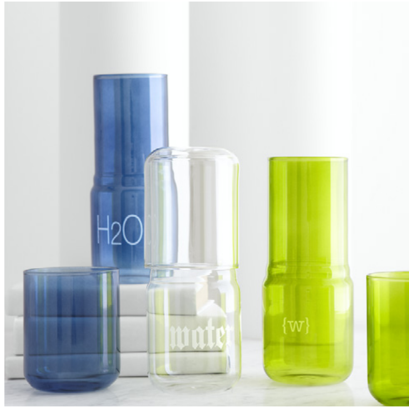
UPSIDEDOWN GLASS CARAFE Hand-blown solid colored glass carafe comes with its own self-storing cup, great for entertaining or bedside refreshment. Since it's solid color - not sprayed on - it'll stay true blue (or green) for years to come. Hand wash. 8.25" h x 3" diam. 50-445676 $28