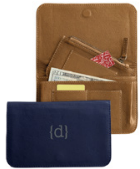
EVERYDAY LEATHER TWO-IN-ONE WALLET Lots of pockets and a removable zipper pouch for versatile toting. Laser engraved. 4.75”h x 7.75”w x 1”d 50-444703 $79