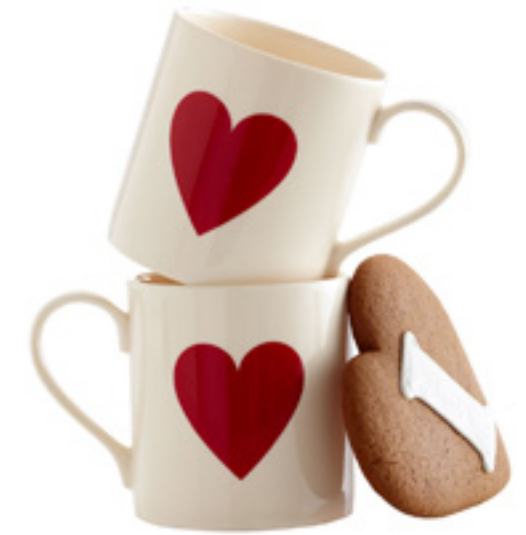
HEART MUG A classy container for coffee or tea, with a side of love. Made in England from fine bone China. 3.5"h x 3.5"d 50-979823 $29