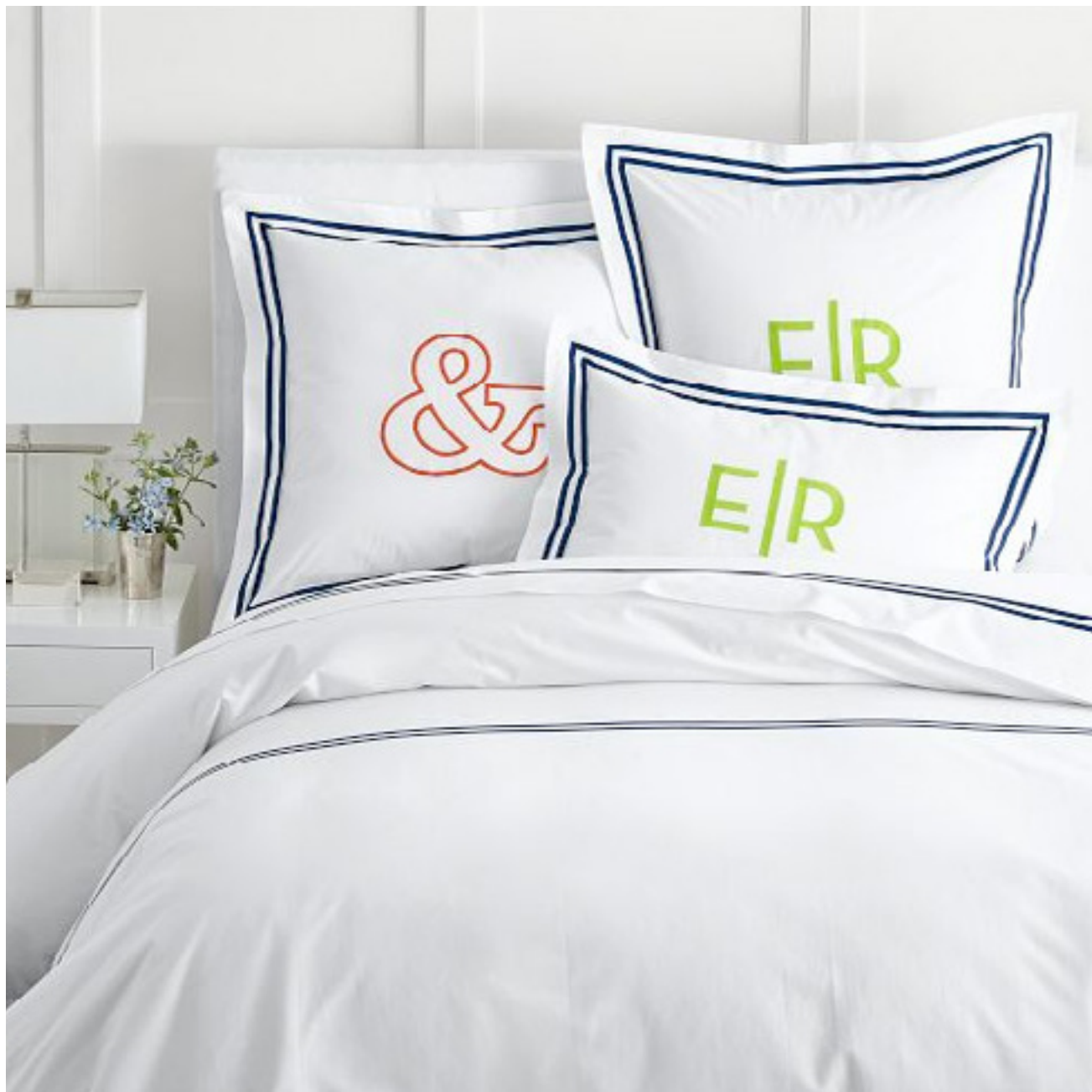
ITALIAN DOUBLE RIBBON DUVET AND SHAMS The classic bed: crisp white cotton accented with a double grosgrain ribbon border. Made in Italy from luxuriously soft white cotton percale, the collection evokes beach houses, mountain resorts and room to relax. DUVET Twin, Full/Queen, King 50-1765171 $280-$375 | SHAMS Standard, King, Euro 50-1764448 $98-$118