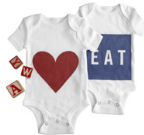
PURE COTTON ONESIE Serious baby love for your favorite little love bean. 3-6 mos/6-12 mos/12-18 mos 50-4283172 $29