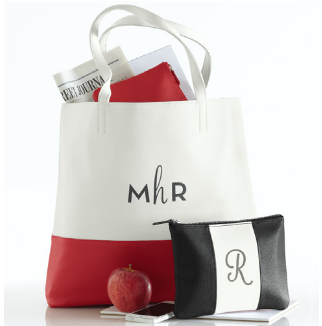
COLORFIELD COLLECTION Made of durable and flexible vegan material with our signature linen lining, our colorblocked tote combines a bright color palette with a sleek UV-printed monogram. The pouch keeps things organized with style. TOTE 14”h x 14”w x 4”d 50-1710797 $99 | ZIP POUCH 6”h x 8”w x .5”d 50-1710946 $35