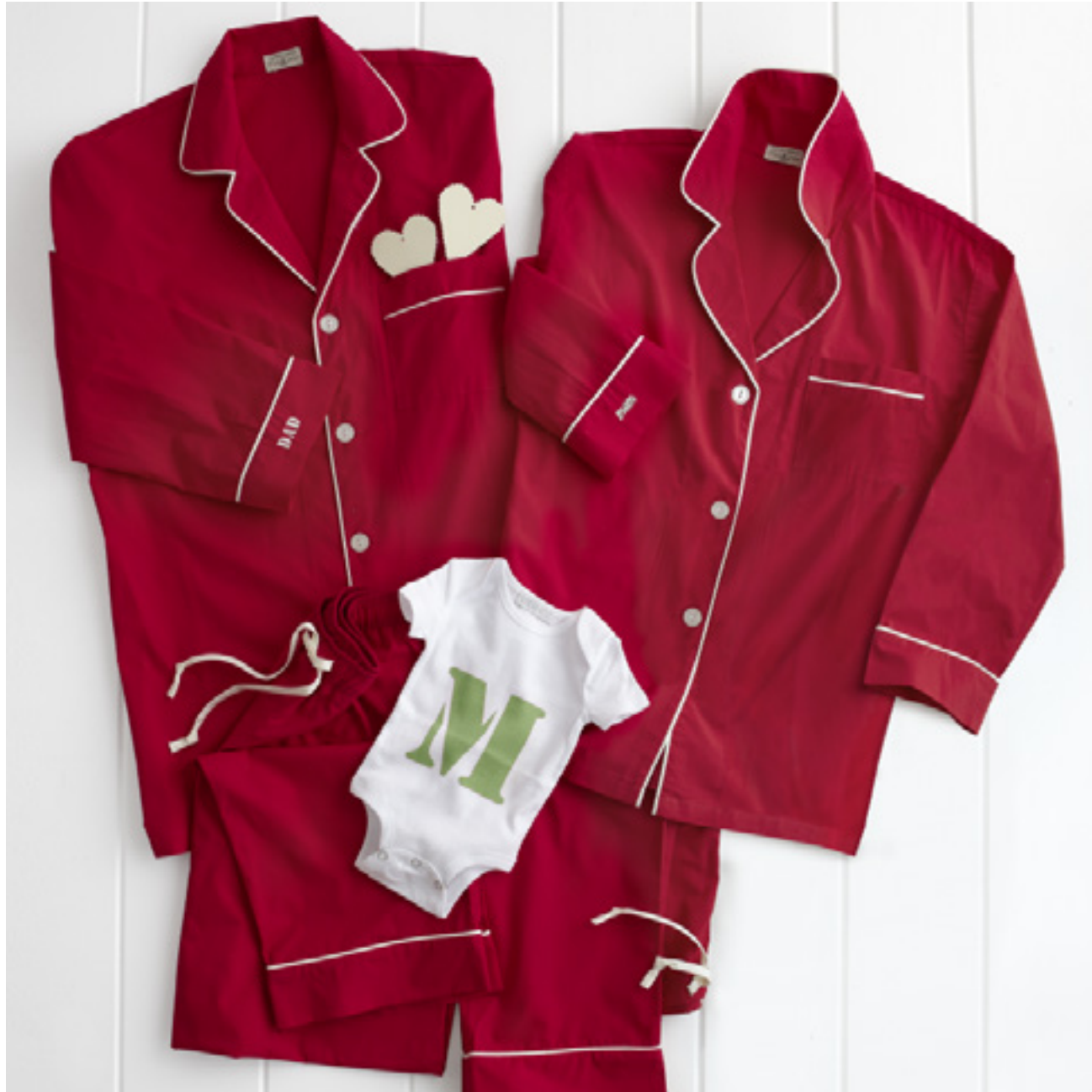
SNUGGLE UP The family that lounges together, stays together. Create a big family love puddle with woven cotton and knitwear PJs for everyone, from the littlest love bug to great grandma nana. WOVEN COTTON PJS, HIM S/M/L/XL 50-1024298 $160 | HER XS/S/M/L/XL 50-1026137 $160 | GRAPHIC PURE COTTON ONESIE 3-6 mos/6-12 mos/12-18 mos 50-4283172 $29