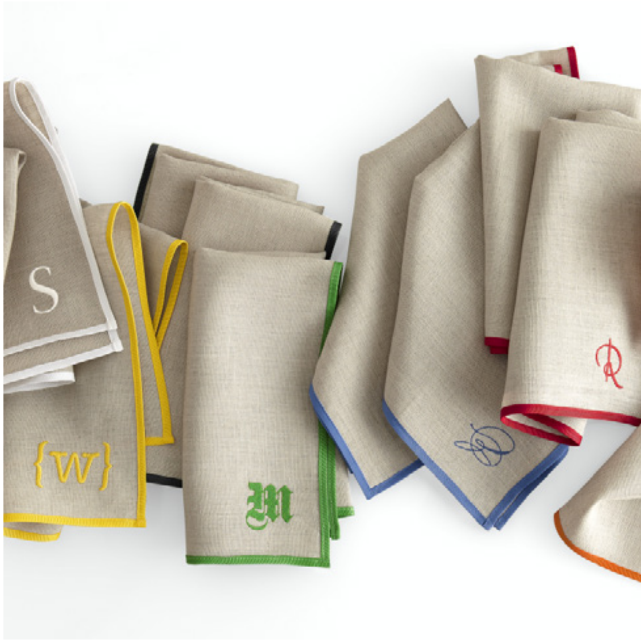
TYPOGRAPHER'S LINEN DINNER NAPKINS, SET OF 4 These warm and rustic flax-toned 100% linen napkins will soften with age and use. Machine washable, the grosgrain ribbon border offers a pop of color - match or contrast the ribbon with your favorite embroidered monogram, from sassy to sophisticated, bright to neutral. 18"h x 18"w 50-426577 $48