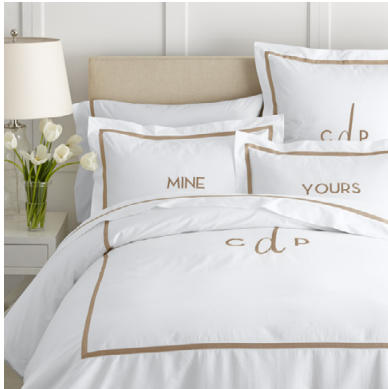
ITALIAN HEMSTITCHED GROSGRAIN DUVET AND SHAMS Elevate sleep to undreamed of heights: made in Italy from pure soft white cotton percale with a hemstitch detail and grosgrain ribbon border. Think leisurely spas and world-class hotels. DUVET COVER Twin, Full/Queen, King/Cal 50-1762012 $280-$375 | SHAMS Standard, King, Euro 50-1766062 $98-$115