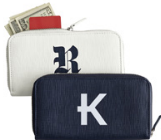
COLORFIELD ZIP WALLET Compact enough to carry in a purse, roomy enough to hold your phone, it has a zip pocket inside. 4.5”h x 7.5”w x 1”d 50-1706696 $69