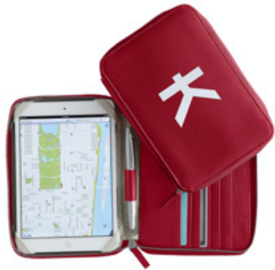
COLORFIELD IPAD MINI HOLDER Linen-lined zippered case also includes space for cards, ID and money. 5.75”h x 8.25”w x 1”d 50-1708080 $55