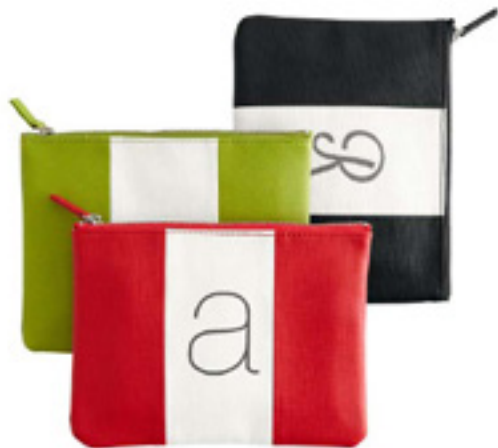
COLORFIELD ZIP POUCH Super for stashing school or work supplies, cosmetics and personal items or a passport and visa. 6”h x 8”w x .5”d 50-1710946 $35