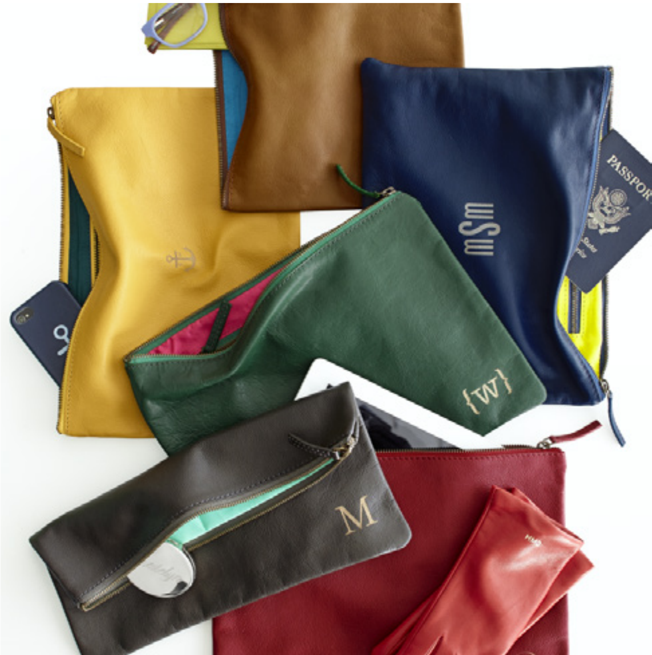
EVERYDAY LEATHER ZIP POUCH From stylish travel to a glam night out, our modern leather pouch can carry everything from an iPad and passport to your wallet, lipstick and phone. One of our favorite pieces, it can really go absolutely anywhere. Personalized using our laser engraving technique. 9”h x 13”w 50-446338 $79 More color options available at markandgraham.com.