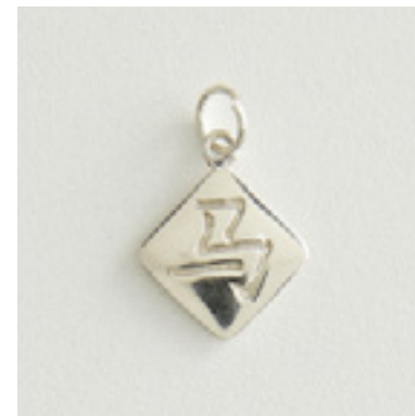
Year of the Horse