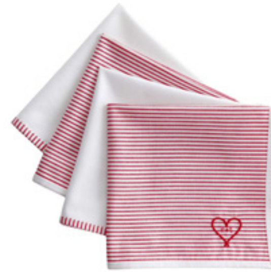
TICKING STRIPE HANDKERCHIEFS, SET OF 4 Each features a uniquely thin embroidery monogram. Set includes two stripe, two solid. 16" x 16" 50-1107515 $29