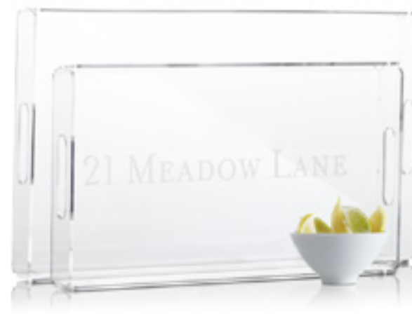
ACRYLIC SERVING TRAY Choose from a subtle lasered or bold UV-printed personalization. Available in two sizes (see opposite page).