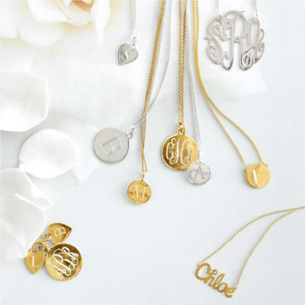
Top Row: MAYA HEART CHARM .5" charm $79 | IZARA CUTOUT 1.25" $249-$899 | Middle Row SOPHIA MEDALLION .75" charm $119-$159 | LIA CHARM .5" charm $79-$89 | CARA MEDALLION .5" charm $109-$119 | Bottom Row SONYA LAYERED .5" and .75" charms $179-$189 | AVA FREESTYLE 1" h $149-$599