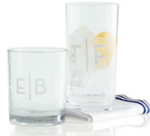
EVERYDAY ACRYLIC DRINKWARE For outdoor entertaining or indoor child safety. 50-1763155 TUMBLER 18 oz. $10 | DOH 14 oz. $8