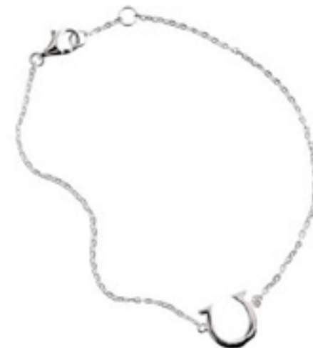
STERLING LUCKY CHARM BRACELET A great gift for the risk taker, the slightly superstitious or an enterprising entrepreneur. 7” long 50-3652997 $59