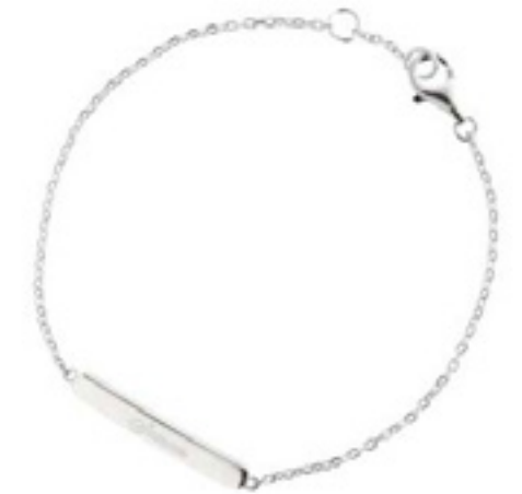
STERLING ID BRACELET A delicate sterling silver chain holds a blank slate for a name, date or special message. Chain: 6.5”; Charm: .5” 50-3652823 $69