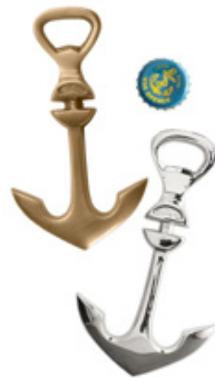
ANCHOR BOTTLE OPENER A little bit prep, a little bit punk. Handmade solid brass. 5.5”h x 3”w 50-392076 $19