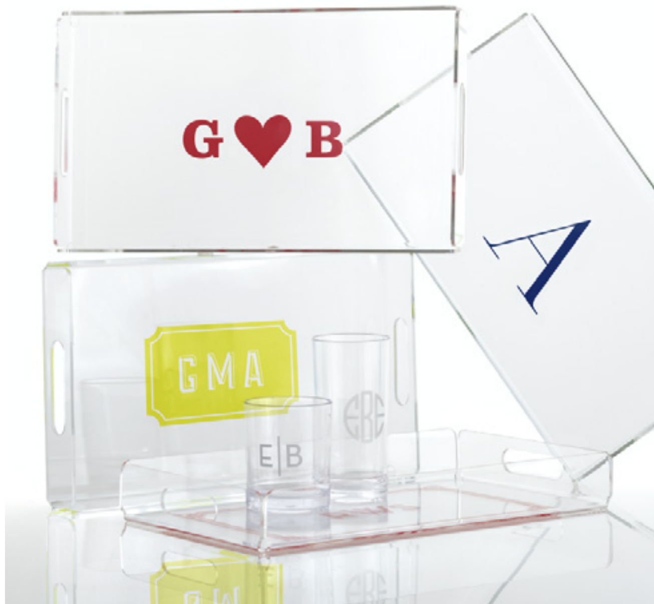
ACRYLIC SERVING TRAY Crafted from a single piece of acrylic, these trays make a mark with an address, family name or special date. The cutout handles and spaces left open at the corners further the style and functionality of these multipurpose trays. 50-370080 SMALL 2.25”h x 9.5”w x 16.5”d $49 ; LARGE 2”h x 12”w x 20”d $59