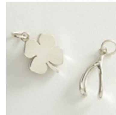
Wishbone and Shamrock