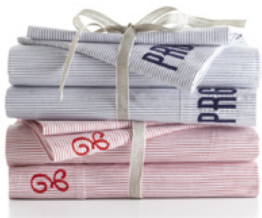
PINSTRIPED SHEET SET 100% yarn-dyed cotton. Set includes a fitted sheet, flat sheet and two pillow cases. Twin-CA King 50-468901 $169-$199