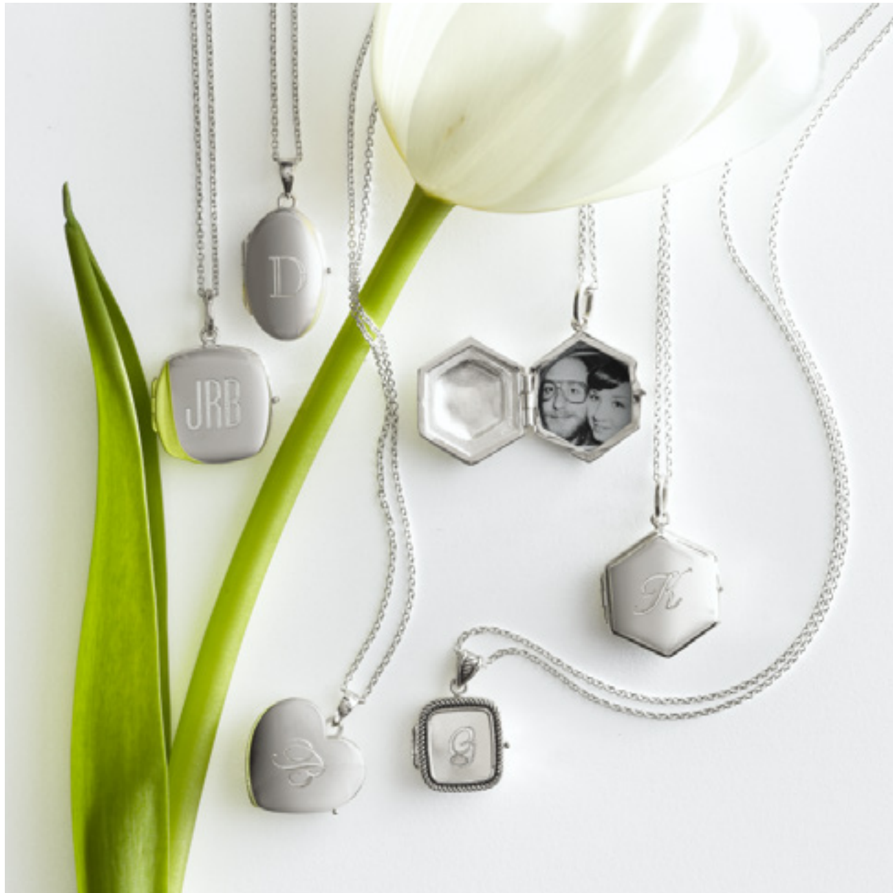
HEIRLOOM LOCKETS The ultimate expression of enduring love, in sterling silver with a single initial. 50-3645306 $135 EACH Clockwise from left: PLAIN SQUARE 1”h x .6”w | SKINNY OVAL 1”h x .6”w | PLAIN HEXAGONAL 1.16”h x .78”w | BRAIDED SQUARE .9”h x .6”w | PLAIN HEART .86”h x .78”w